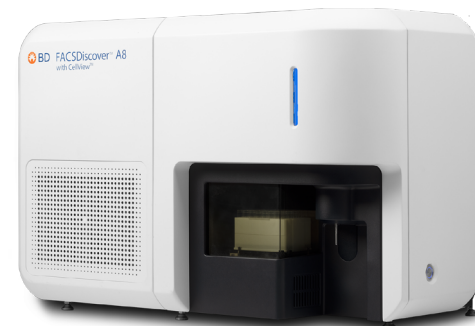
BD FACSDiscover™ Cell Analyzer

Find out about our new BD FACSDiscover™ flow cytometry platforms and get the latest news about the family of BD Horizon Real™ Reagents , which contain bright, clean, and laser-specific dyes to help streamline the path to your scientific discoveries.